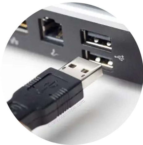
USB A / C

There will be variations such as 2.5mm / 3.5mm Jack Plug options depending on the make and model of the phone you are using the Headset Training Bundle with.