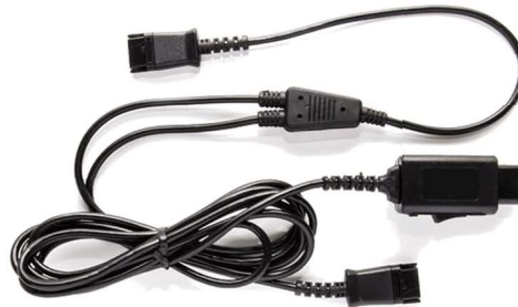
1 x Y-Training Connection Cable