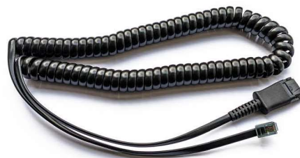
1 x QD Connection Cable (This will be different depending on the device you are connecting to i.e USB or Telephone)