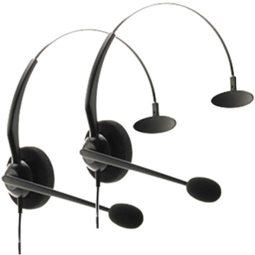
2 x Noise Cancelling Headsets (Monaural or Binaural)

Unpack all items you have received in your bundle. You will have 2 x Headset and 1 x Y-Training Cable and a Connection cable (USB Versions will have a USB-C Adapter). See images below for guidance.