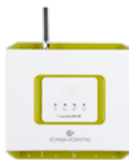
2N® EasyGate PRO

Today, an emergency communication solution is an essential part of every lift. It provides a connection between the lift and important technical support services, which enables you to call for expert help. Technologically advanced lift communicators from 2N also meet strict European standards (EN 81-28, 70) and, thanks to their easy operation, they are an important aid when performing regular or emergency service.