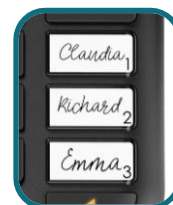
3 direct memory keys with name cards on corded base