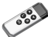
Remote control for sound easy settings