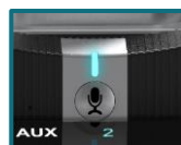
Microphone button to cut TV sound and listen to ambient noises