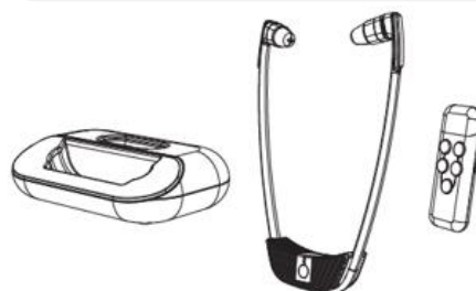
A charging base + a headset + a remote control