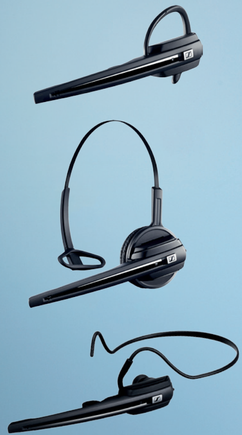
Note: Neckband available as accessory