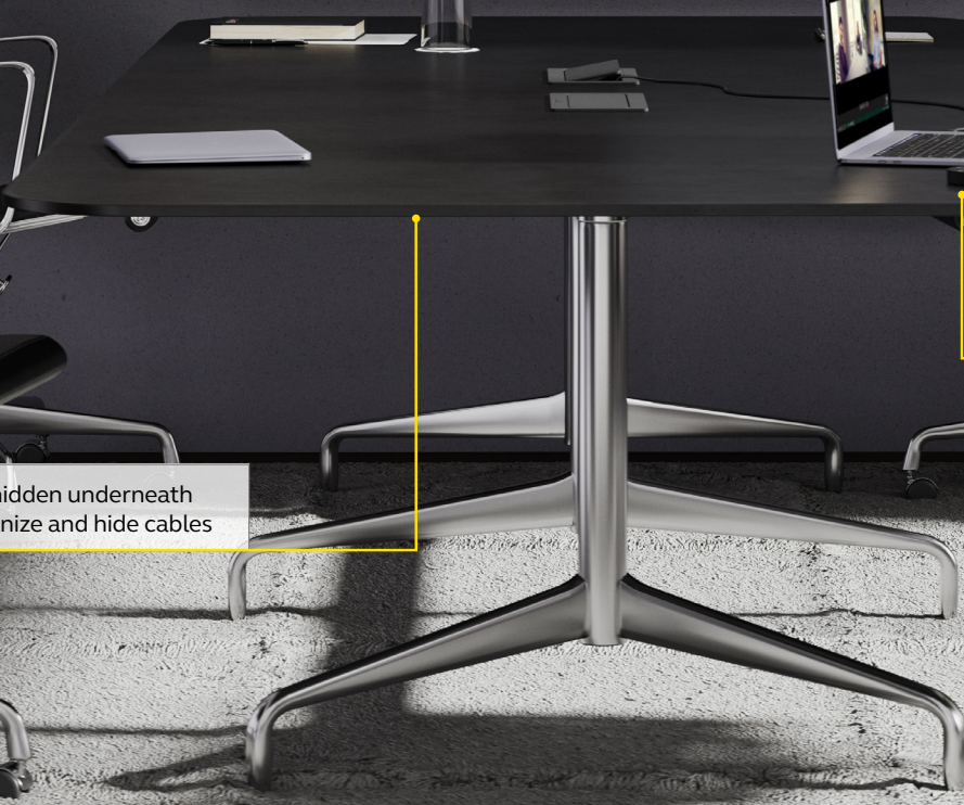
Jabra or Targus Hub hidden underneath the table to help organize and hide cables