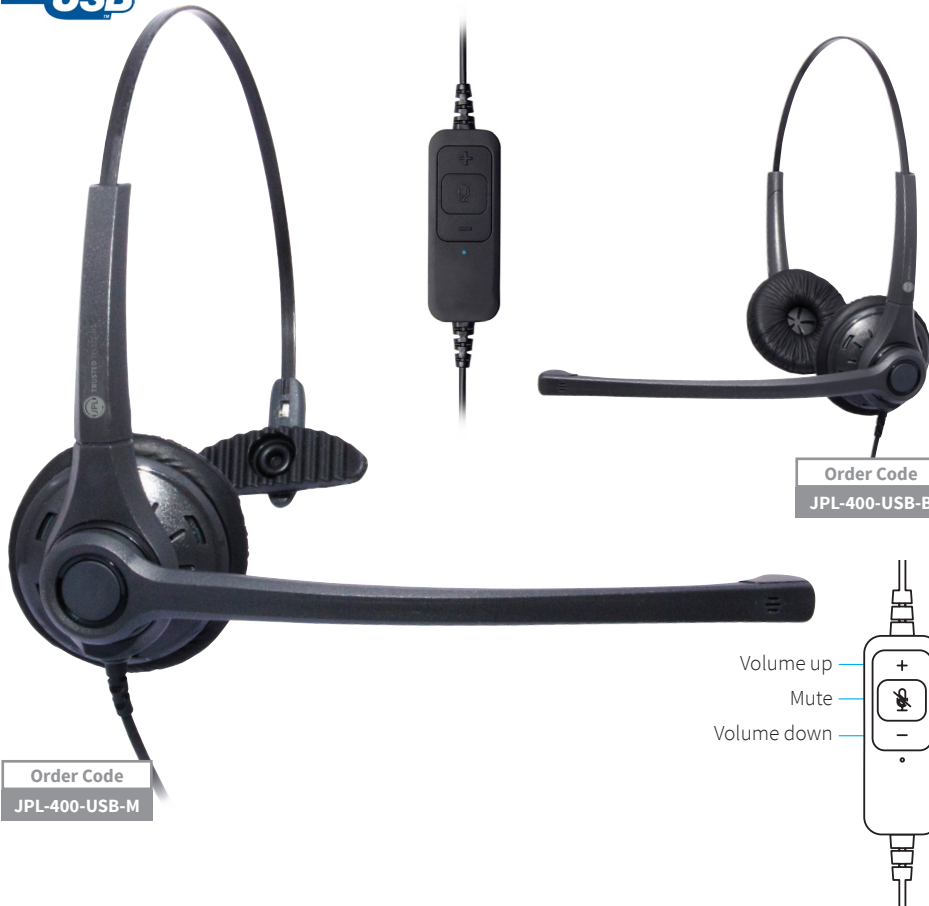
Order Code JPL-400-USB-M