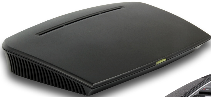
Konftel IP DECT 10