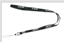
Hand strap RO01