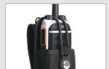
Carrying case (nylon) NCN011