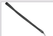
Hand strap RO03