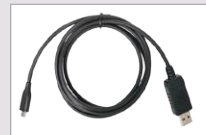
Programming cable (USB) PC69