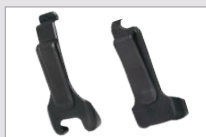
Belt clip BC20/BC21