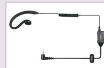
Earphone with C-clip EHS16