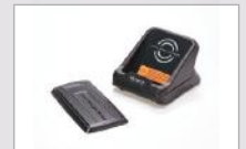
Wireless charging kit POA113