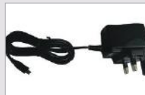
Universal Switching Power Adapter (Micro USB)