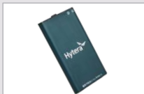
Lithium-ion battery (2000 mAh) BL2009