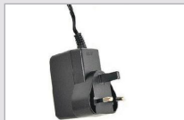
Switching power adapter for charger PS1044