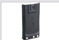
Lithium-Ion Battery (1500mAh) BL1504