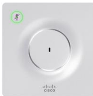
Figure 3. Cisco TelePresence Ceiling Microphone