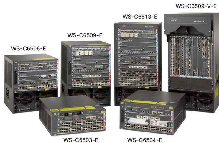
Figure 1. Cisco Catalyst 6500-E Series Chassis

The Cisco Catalyst 6500-E Series Chassis provides superior investment protection by supporting multiple generations of products in the same chassis, lowering the total cost of ownership. The Cisco Catalyst 6500-E Series Chassis (Figure 1) supports all the Cisco Catalyst 6500 Supervisor Engines up to and including the Cisco Catalyst 6500 Series Supervisor Engine 2T, and associated LAN, WAN, and services modules.