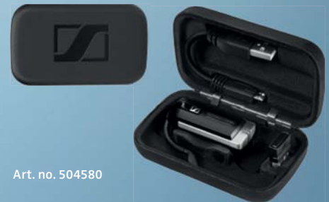
Art. no. 504580