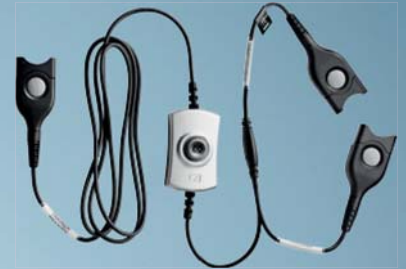
ATC 01: Art. no. 500106

The Y cable allows a trainer to supervise the trainee during customer calls. Additionally, the Y cable ATC 02 allows the trainer to mute the microphone at any given time.