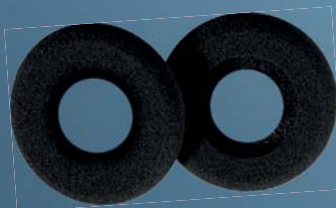
HZP 32: Art. no. 504550