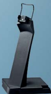
Art. no. 504366