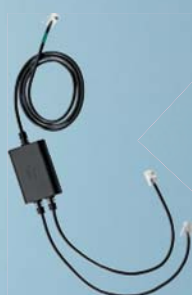
CEHS-SN 01: Art. no. 504101

While EHS was intended for desk phones, it is also possible to connect your mobile phone to the DECT base stations instead of a desk phone. In this case, use CEHS-MB 01