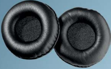
HZP 34: Art. no. 504560