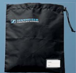
Art. no. 092818