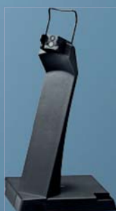
Art. no. 506039