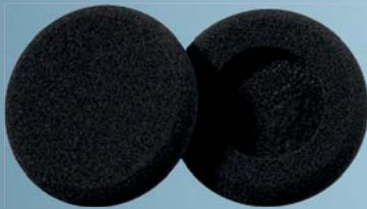
Art. no. 504411