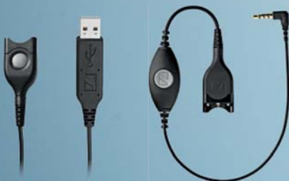
USB ED 01: Art. no. 506035

Connect wired headsets with Easy Disconnect (ED) plug to a computer, smart phones or DECT handsets: USB-ED 01, CBB 01, CMB 01 CTRL and CCEL 19x. Check the individual device connections at the Headset Compatibility Guide on www.sennheiser.com/headsetcompatibility