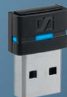
Art. no. 504578