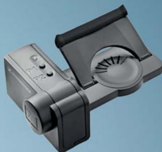
Art. no. 500712