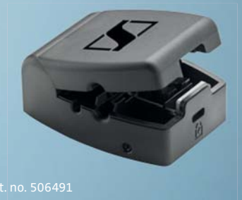
Art. no. 506491