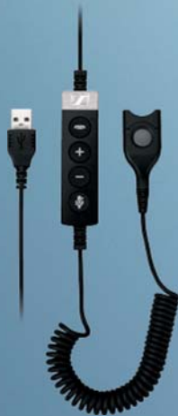
USB-ED CC 01: Art. no. 506478

*Variants: Circle™ SC 230, SC 260 and Century™ SC 630, SC 660