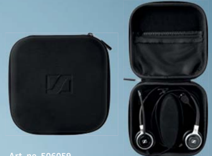
Art. no. 506059