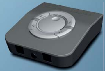
Art. no. 504534

* UI 770 do not comply with the Noise at Work EU Directive for narrowband headsets. In case of narrowband headset used together with UI 770 we recommend to use an EU limiter adapter (EU limiter switched off in UI 770).