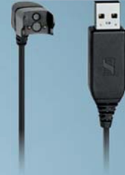
Art. no. 504365