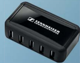
Art. no. 504348