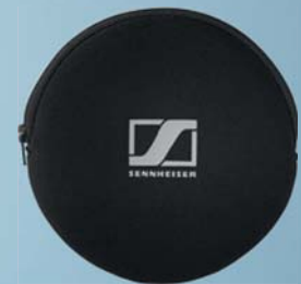
Art. no. 506051