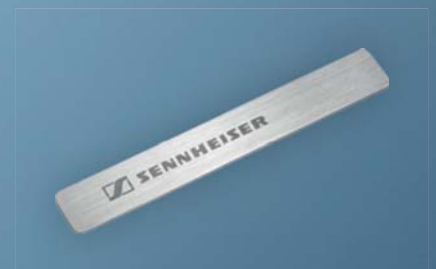
Art. no. 504594

The fixation kit ensures via a magnet holder that the call control unit stays in the same position on the desk. Suitable for SC 630 USB CTRL, SC 660 USB CTRL, SC 630 USB ML, SC 660 USB ML, SC 230 USB CTRL II, SC 260 USB CTRL II, SC 230 USB MS II and SC 260 USB MS II.