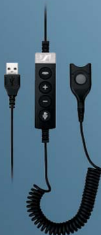
USB-ED CC 01 MS: Art. no. 506479

*Variants: Circle™ SC 230, SC 260 and Century™ SC 630, SC 660