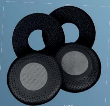
HZP 46: Art. no. 506512