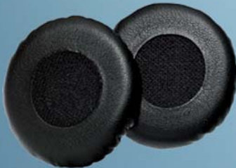
Art. no. 504412