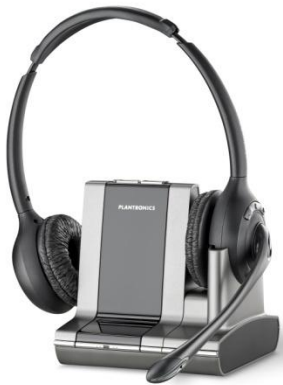
*This picture shows the Binaural (WO350) version

Using a Plantronics Savi Office headset for PC calls will deliver a simpler, more comfortable and better sounding audio experience than you could get using just your computer's internal microphone and speaker.