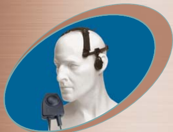
■ CXR5/550 ▲ CXR5/950