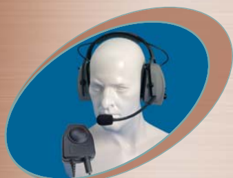
■ CHP550D ▲ CHP950D