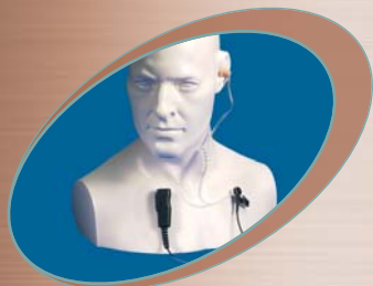
■ EA15/550 ▲ EA15/950