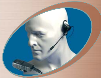
■ EA19/550 ▲ EA19/950