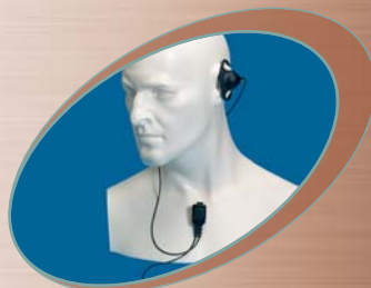
■ EA12/550 ▲ EA12/950