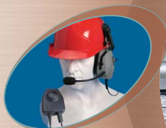
■ CHP550HS ▲ CHP950HS

*Used to charge ATEX models in a non hazardous-environment