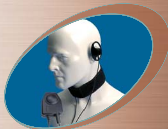
■ CXR16/550 ▲ CXR16/950