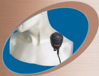
■ CMP550 ▲ CMP950