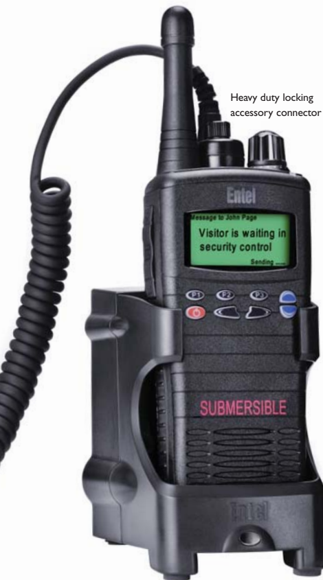
Pictured: Radio with optional stubby antenna and CSAHT rapid charger