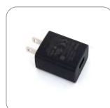
Power Adapter (USB)