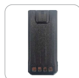
Li-polymer Battery 4000mAh